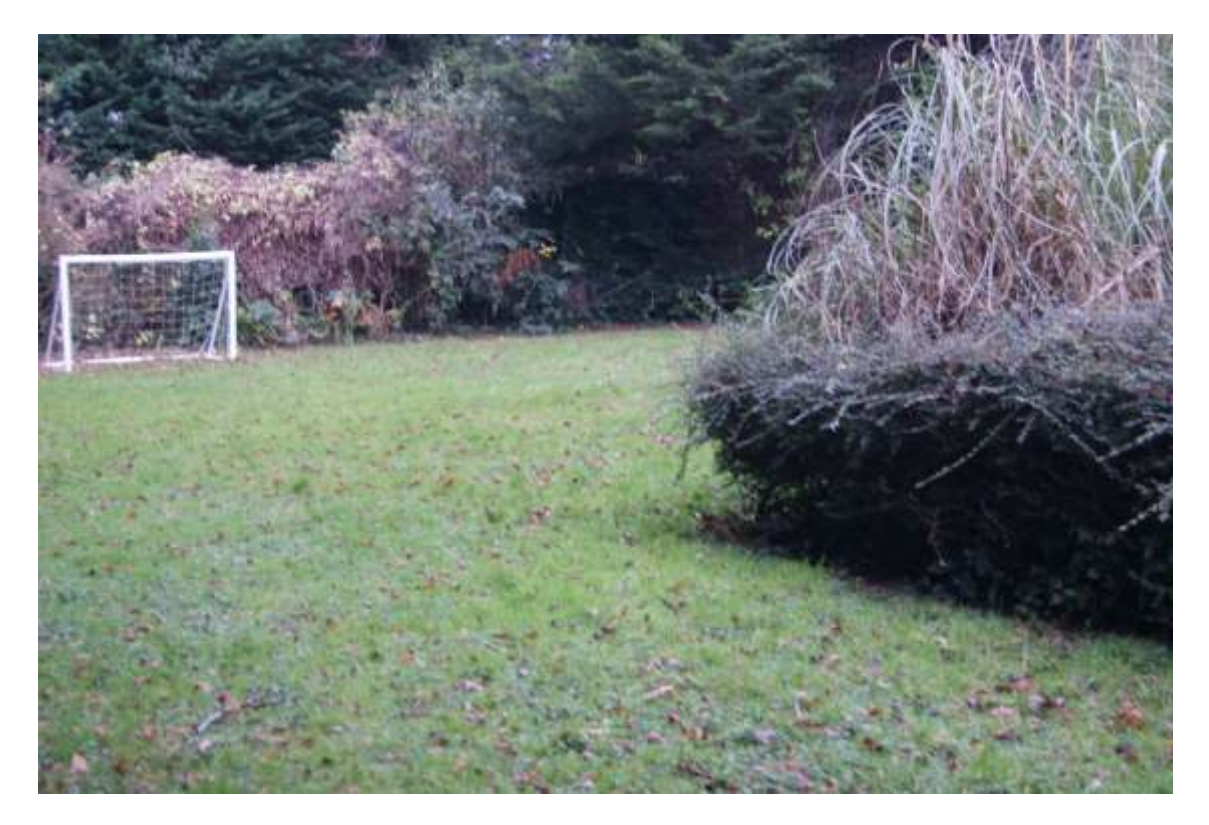
Plate 2. The development site