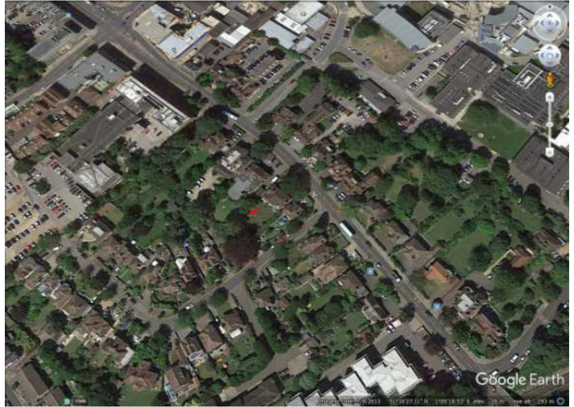
Plate 1. Location of trench (Google Earth 2013)